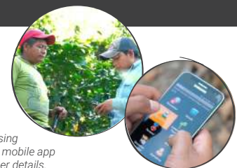
Field Officer using the Farmforce mobile app to record farmer details.